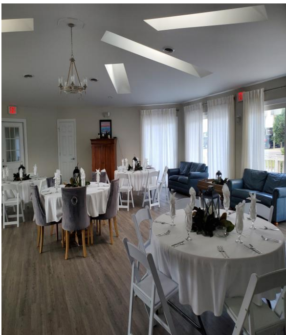
Clubhouse Rental – Rehearsal Dinner