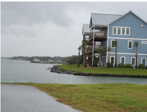
King High Tide September 17,2020 End of Observation

*Do you have something you would like to see included in the monthly newsletter? Please email me your idea and I will do my best to incorporate it in upcoming issues.