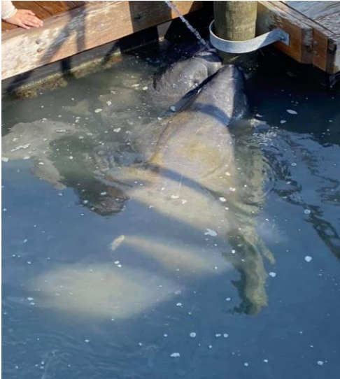
Manatees in the Canal

*We had some visitors in the community over the past couple of weeks. There have been several manatees spotted in the canals. You can see pictures and videos of our visitors on the FB page Queens Grant Community Information. This is a great page for the community to share pictures as well as information. If you don't follow this page, I would suggest you give it a look.