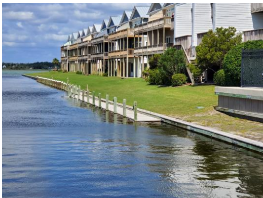
King High Tide Monday September 21, 2020 South Side of Tower Court