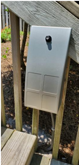
New Beach Access Light

We have installed one new light on the beach access between buildings A&B to see if it would fit. The Rec Board has approved replacing all of the beach access lights. The new ones are turtle friendly.